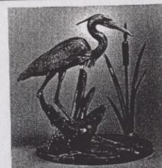
"MARSH STALKER" Great Blue Heron—18" Edition of 75